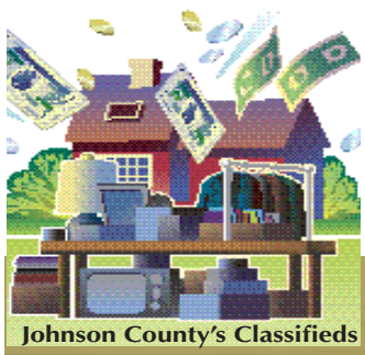
Johnson County's Classifieds